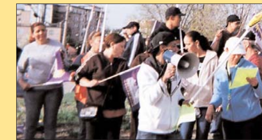
Workers rally at Fifth Ave, Waltham on April 30, 2009.