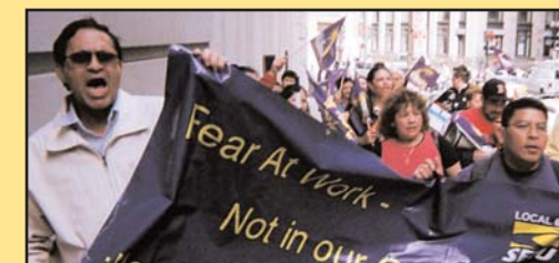
Downtown workers rally on April 30, 2009.